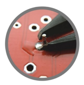
Trim with flush cutters if needed.

Note: Solder should be smooth and shiny.